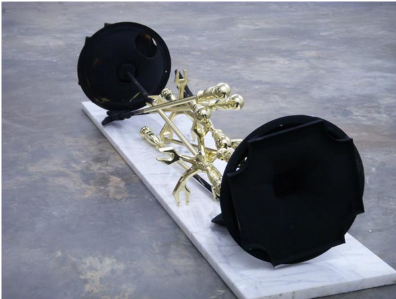
"Norfolk Southern," 2007. Brass fireplace tools, marble, soot, 14" x 47" x 14". Courtesy of artist.

Rail: Very simple. And in the same year you made "Norfolk Southern," a ready-made work of essentially two brass fireplace irons facing each other while lying on top of a piece of marble on the floor.