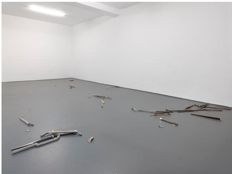
Daniel Turner, "Untitled," 2013. Polyethylene, stainless steel, aluminum, iron, dimensions variable. Installation view Bischoff

Rail: In looking at the UV tinted glass and rubber pieces, "Untitled (4/13/12)," "Untitled Pylamyra (4/17/12)," and "Untitled Pylamyra (4/15/12)," the black rubber that covers the edges functions as a form of drawing as well as a container of space. In some ways they evoke Donald Judd's early works because the issues of art and objecthood, where they are between paintings, reliefs, and sculptures and were all mediated simultaneously through surface, color, form, and so on.